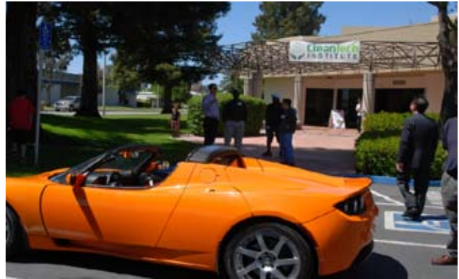
Outside the CleanTech Institute in Fremont, CA.

CTI and IANANO are at the forefront of the clean